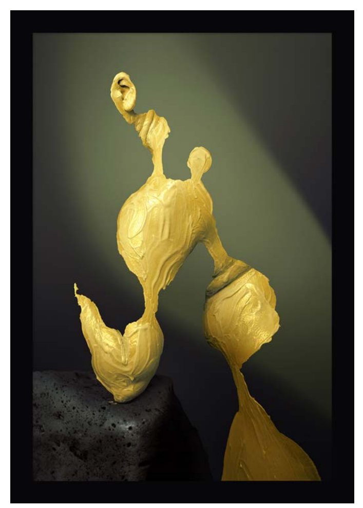
Chelsea Ellis, Aurum, 2023, Photograph, 66 x 46 inches

In my photographic work, I use my body and paint to create composite portraits of humanoid forms that blur the boundaries between the familiar and unfamiliar, investigating structures of the human body and posing the questions: Who are we? What are we? - Chelsea Ellis